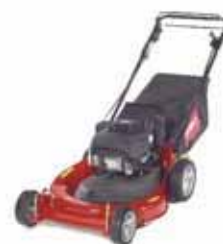
66cm Heavy Duty Walk Behind