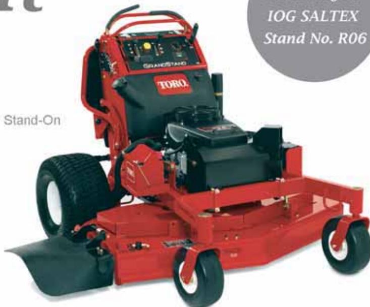
Grandstand™ Stand-On Zero Turn

Optional - Recycling ® Kit enables the deck to deliver superb mulching performance