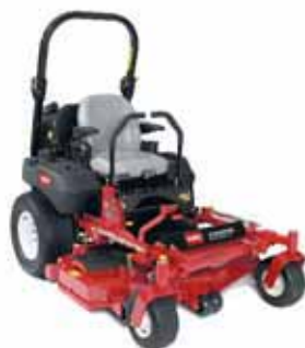
Z Master Zero Turn Range