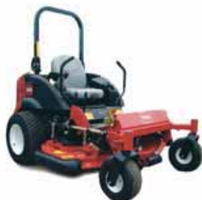
Groundsmaster 7200 / 7210 Range